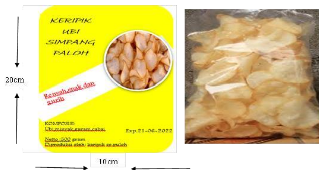
Fig 5. The difference between the initial packaging and the proposal

The difference between the actual image and the proposed sweet potato chip product packaging can be seen in the following figure: