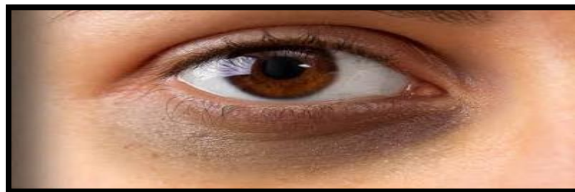
Figure#2: Appearance of Dark Circles under Eye

Dark circles under eyes are of many types and classification mainly depends upon the cause of dark circles.