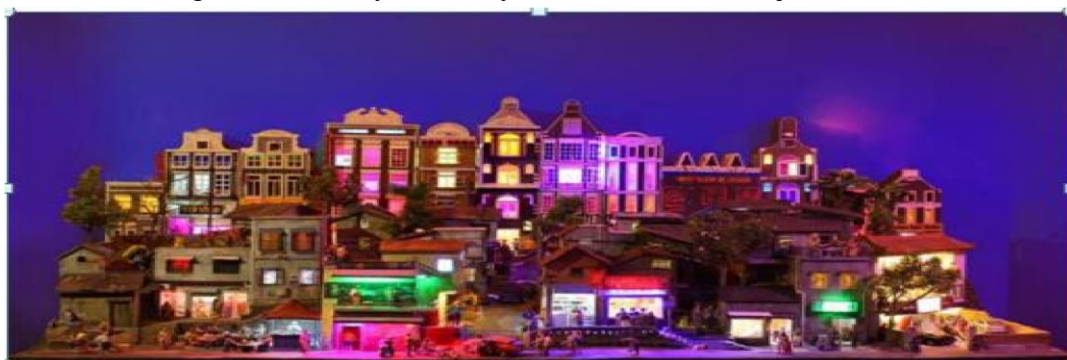
Figure 3, A Tale of Two Cities.

A Tale of Two Cities is one of Li Zhanyang's colored scenic sculptures. Drawing upon gabled building from Amsterdam and stilted buildings from Chongqing, the artist imitates the separate street view in one work while inserting details of ordinary people's daily life in the scenes of this sculpture, such as crowded gather around the site of a car accident, a busy night market and dissolute red light area. As Li (2002) wrote, "I make a record of the all-encompassing daily life by using the artifice at hand." Therefore, A Tale of Two Cities solidifies a very moment catching the fleeting emotions and episodes of daily life in the sculpture's space to represent the subject of urban life. Taking the huge picture of A Tale of Two Cities as a background poster insinuates that Li Zhanyang Vendor: Selling Bread will dynamically evolve from the subject urban life.