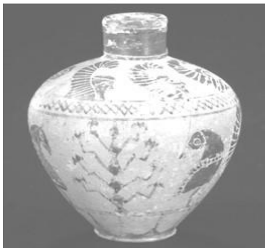
Figure 5: Proto-Corinthian aryballos, Royal Museums of Art and History, Brussels, inv. A2 Adapted from 14

Most perfume containers share some characteristics: narrow neck and opening, wide flat-rimmed or funnel shaped mouth. The most are quite small. According to Verbanck-Piérard's and Massar's reference to Rasmussen the chosen decorative images on perfume vases referred to the exotic origin of their contents. The oriental sign decoration of proto-Corinthian vases (Fig.5) could inform about the real or supposed Near-Eastern origin of their contents. 14