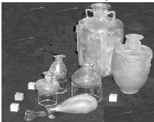
Figure 2: Ancient roman utensils to cosmetics' preparation. Adapted from 18

There are numerous recipes and depictions of the perfume preparation in numerous ancient temples all over the known world. 9 Aroma use was spread from Greece, to Rome (Fig.2, Fig.3) 18 and later to the Islamic world.