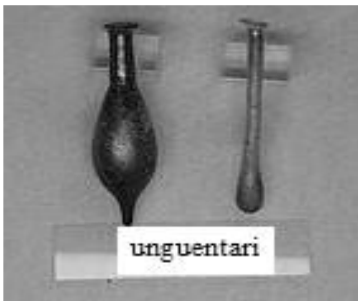
Figure 3: Roman perfume bottles (unguentari) on display at Villa Boscoreale . Adapted from 19 Giuseppe Squillace has translated the “De odoribus” by Theophrastus where he mentioned his knowledge about the perfumes and scents around the Mediterranean world; from Lydia to Athens, Egypt and Syria. 20

Fragrances (raw materials) were mainly imported from the East to be processed, refined and produce final ointments and perfumes, as concluded from Attard’s reference to Launert’s work. 21 A common product was muron , a liquid or semi-liquid perfume from vegetable oil (olive, almond, sesame oil etc) with an astringent agent, to improve the ability of the oil to absorb and enhance smells of scented elements (mainly from plants, such as petals, leaves, roots, resins). 14 The ancient Greeks and others imported as well perfumes from the East. The most known were “vrentheion”, the famous Lydian perfume smelling musk and lavender, which was manufactured in small pots, “susinum”, the aromatic oil of lily of Susa, “Mendesian” (myrrh and cassia with assorted gums and resins) from the ancient city of Mendes near Nile, from balanus oil flavored with bitter almond oil from Egypt, known as “metopion”, and several other ingredients. 8,9,22