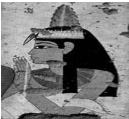
Figure 1: Perfume cones. Adapted from 9

Dollinger referring to Lichtheim in his work informs us that the Egyptians, during New Kingdom, carried little cones in their hair, which had been made of solid perfume and scented for a long period (Fig. 1). 7,9