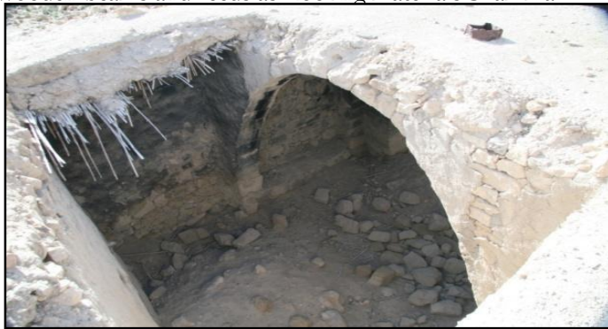
FIGURE 15: Details of roofing layers at Shammakh

Floors are always beaten mud unless natural bed rock is available. Fortunately, some of the rolling stones which had been used to beat the roofs and the floors were left in situ (FIGURE 16).