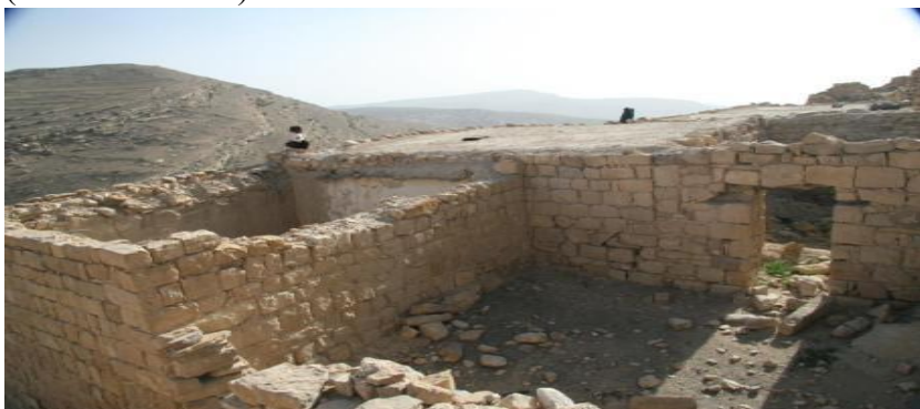
FIGURE 9: Construction method of walls at Shammakh.

Walls usually consist of two rows of mostly dressed stones and the space between them filled with mud and rubble (FIGURES 9-10).