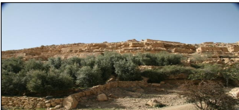
FIGURE 10: Details of construction of partitioned walls at Shammakh