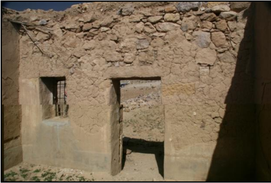
FIGURE 11: Details of coating technique and material

The average width of the external walls is 75cm, while it is 50 cm for the partition and interior walls as well as for the arches. Walls are always coated with thick lime mud mixed with straw (FIGURE 11).