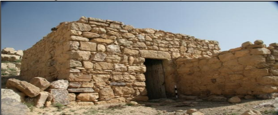
FIGURE 5: A Single - room house at Shammakh.

This project (Hijaz Railway) employed many local inhabitants in the construction works and wood cutting for rail fuel (Shqiarat et al 2011) However, as Glueck (1940; 1968) points out, most of the Juniper forests were cut down prior to World War I by the Turks to construct the Hijaz railroad. Further east on the plateau, large grasslands and rolling hills cover the territory. In many areas such as Shawbak large tracks of this land have been bulldozed and cultivated. Further east the area returns to a hyper arid desert environment. The territory of Shawbak is an agriculturally rich area with springs and open valleys suitable for farming and pasturing. However, the settlements patterns from the survey, revealed that the main heartland of Shawbak was only sparsely occupied during the Iron Age period (Hart 1989). Abandoning Shammakh left 75 houses empty, 80% of which are single-room dwellings with an average area of 35m 2 (FIGURES 5-6).