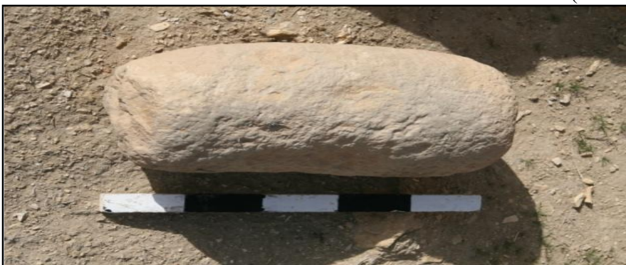
FIGURE 16: Rolling stone used to beat roof and floors at Shammakh

Floors are always beaten mud unless natural bed rock is available. Fortunately, some of the rolling stones which had been used to beat the roofs and the floors were left in situ (FIGURE 16).