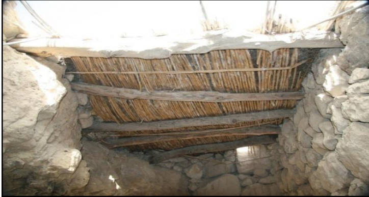
FIGURE 14: Wooden beams and reeds as Roofing materials Shammakh

It seemed to us that these wooded posts were a later addition and not contemporary with the original build. Roofs always consist of three layers of roofing materials: a group of juniper beams arranged in 1.5 meter intervals span the side walls and the arches, or if the width of the room is small the beams were placed directly on the wall. Second, a layer of reeds bound together span the whole roof space and form a floor to carry the third 20-25 cm-thick layer which is lime mud mixed with straw and usually beaten with heavy rolling stones (FIGURES 14-15).