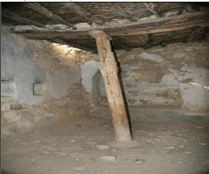
FIGURE 13: Wooden Posts supporting the roofs at Shammakh

However in two examples we found wooden buttresses supporting the roofs and these were found in small rooms where arches are not structurally required, and where the usual length of the juniper beams can span the whole room (FIGURE 13).