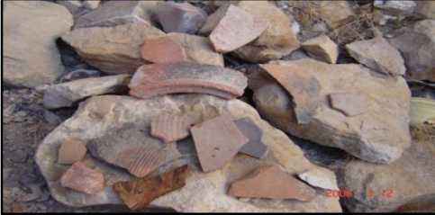
FIGURE 2: A pottery assemblage collected from the surface of Shammakh ranges in Date from Iron Age to the Crusade Period.

The presence of surface artifact scatters suggests that Shammakh has a long history of human settlement, probably due to the proximity of a natural spring, the fertility of the soil, and the naturally fortified and sheltered nature of the site. Occupation begins in the Iron Age (1200-539 BC.) as indicated by the presence of Edomite pottery, and continues through Nabatean, Byzantine, and Islamic times (FIGURES 2-3-4), (personal observation).