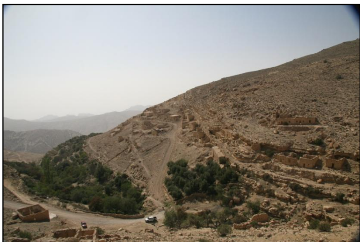
FIGURE 1: General view of Shammakh.

The vegetation of the area, is adapted to the semi-arid bioclimaticological zone and is generally of the evergreen needle-leaved woodland type, which is resistant to cold. Shawbak receives an average of 300 mm of rainfall per annum, yet yearly amounts range from 150 mm to 400 mm (Hashemite Kingdom of Jordan 1986: 13-15). Rainfall distributions are limited to the winter months from November to April and are highly variable within any given year, such that the majority of total annual rainfall can occur within any given year, such that the majority of total annual rainfall can occur within just a few days (Willimott et al. 1964: 28-29). Accordingly, agricultural yields may be highly variable as well. As an extension of al-Jabal the Jabal al-Shara mountain range stretches from Shawbak southward, across Wadi Musa and the Petra basin. Today these mountains are characterized by a moderately semi-arid Mediterranean climate (Kürschner 1986: 47).