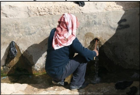
FIGURE 20: The water spring of Shammakh

The main source of water at Shammakh is the natural spring which flows at some 540 liters per hour and which appears to have been enough to sustain the whole population and support their nearby fields. The spring water is channeled into a collection reservoir (FIGURE 20) and distributed among the families to irrigate their fields following traditional norms of water distribution that ensure equality of water rights and to ensure that each family field is irrigated every 21 days.