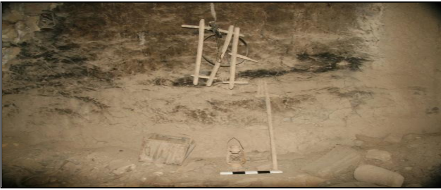
FIGURE 17: Traditional material cultures left in situ at Shammakh Usually, in side of rooms near the door they used grain silos made by the woman out of unfired mud in the style and decoration only found in Shawbak villages Kawayir alqamh (FIGURE18). (Khammash 1984).