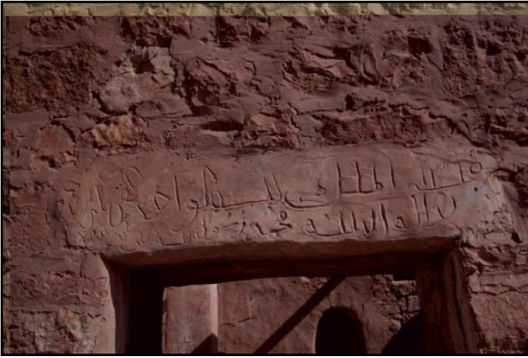
FIGURE 19: The foundation inscription of the prayer house of Shammakh

The main source of water at Shammakh is the natural spring which flows at some 540 liters per hour and which appears to have been enough to sustain the whole population and support their nearby fields. The spring water is channeled into a collection reservoir (FIGURE 20) and distributed among the families to irrigate their fields following traditional norms of water distribution that ensure equality of water rights and to ensure that each family field is irrigated every 21 days.