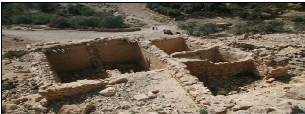
FIGURE 7: A Twin - Room house at Shammakh.