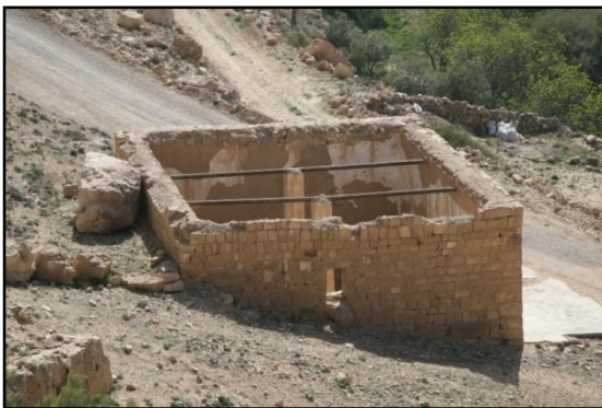
FIGURE 21: New roofing material, rail bars, used in the construct the prayer house at Shammakh

Shammakh's story provides interesting data for our understanding of settlement growth, settlement abandonment, and demographic archaeology. The following ethno-archaeological notes reveal useful insights into these processes. The first point is that the prayer house, temples, sanctuary, and churches are not always the first to be built in the village and they are not always in the center of the settlement. Here we would like to stress that while the process of initial settlement and subsequent growth is voluntary, places of worship will be among the last buildings to be erected, and only occur when the population reaches a critical mass. Before this, worship is restricted to the household level or in the open air. It is also worth noting that, when settlement growth is gradual, a place of worship might be located on the margins rather than at the centre. When settlement is voluntary and gradual, rather than preplanned, the process will be continuous and long-lasting. At Shammakh, this process lasted for about one hundred years and probably coincided with population growth. New buildings, constructed over time, may possess new architectural elements and employ different architectural techniques. This is illustrated by the construction and roofing system of the masjid whose roof was supported by stone posts in the middle with metal rails, mainly from the Hijaz Railway, built during late Ottoman times. (FIGURE 21).