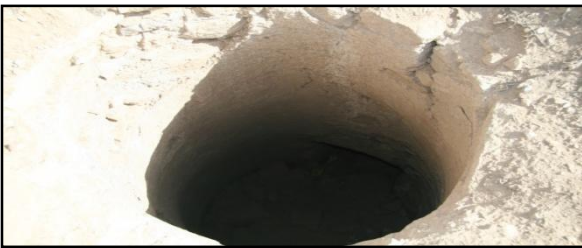
FIGURE 3: Nabataean rock-cut well at Shammakh.