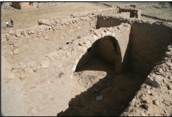
FIGURE 12: Roofing System based on Arches at Shammakh

The roofing system was principally based on arches that are usually built of well-dressed and similar-sized stones (FIGURE 12).