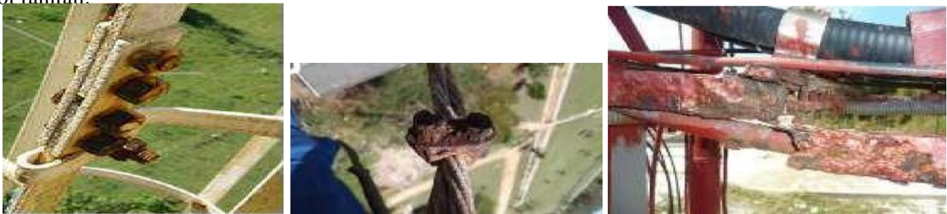
Figure (1): Effects of the coastal atmosphere on the corrosion of components in metal structures

This phenomenon is accentuated in island territories such as the Caribbean where, motivated by climate change, there is a trend towards greater aggressiveness in terms of sea penetrations, increased winds and the frequency of rainfall.