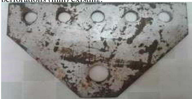
(a) Corrosion-free part

At the macro level, an equalizing plate supported on a model AT-60 structure was analyzed, applying the gravimetric analysis method to determine the loss of thickness (mm) and mass (g) and the diameter of the perforations (mm) existing.