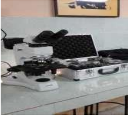
Figure (2): NOVEL brand metallographic microscope or electronic tweeter

in coastal atmosphere at north of Ciego de Avila province. To observe the damage caused by corrosion, the samples were subjected to a metallographic analysis (micro level) in a NOVEL eye microscope (Figure 2) from which the corresponding images were obtained.