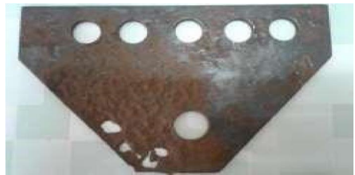
(b) Corroded part