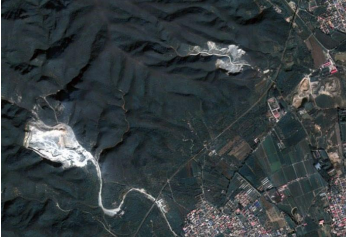
Figure 1: Mine RS monitoring screen

If the solid waste violates the relevant standards in the process of stacking and is not properly managed, it will easily slide under the influence of rain and vibration, which will have a serious impact on the surrounding environment. In the process of land use, every characteristic and future development mode must be considered [10]. There are many detailed information about land, and it will change greatly with the passage of time, the change of natural environment and human intervention. In some mines, underground storage is used in the process of excavation, which changes the distribution of groundwater, greatly affects the stability of surface structure, and then causes disasters such as collapse. Figure 1 shows the RS monitoring screen of the mine.