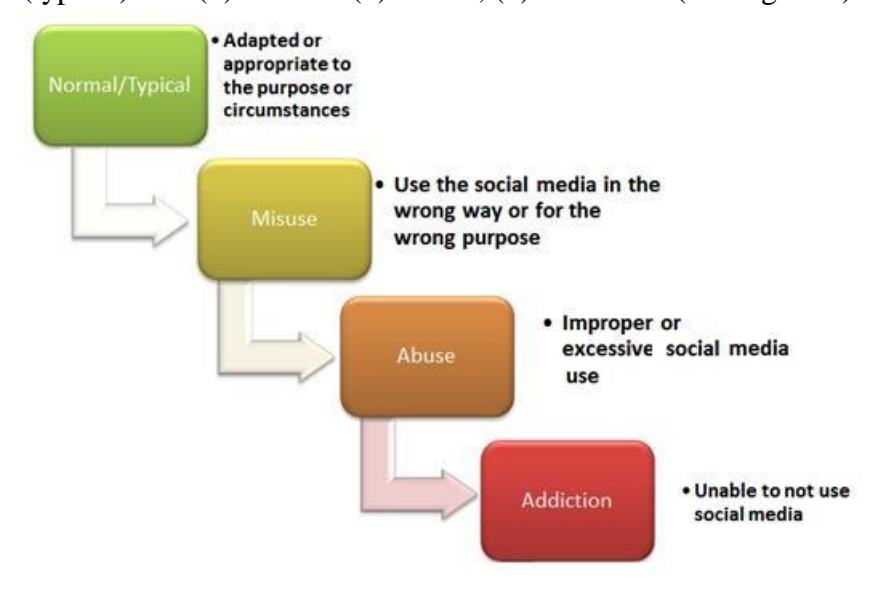
Figure 2: From Normal to Addiction Stages

(typical) use. (2) Misuse. (3) Abuse, (4) Addiction (see Figure 2)