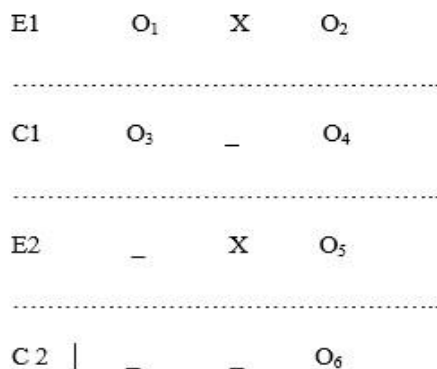
Figure 1. Solomon Four Non-Equivalent Control Group Research Design