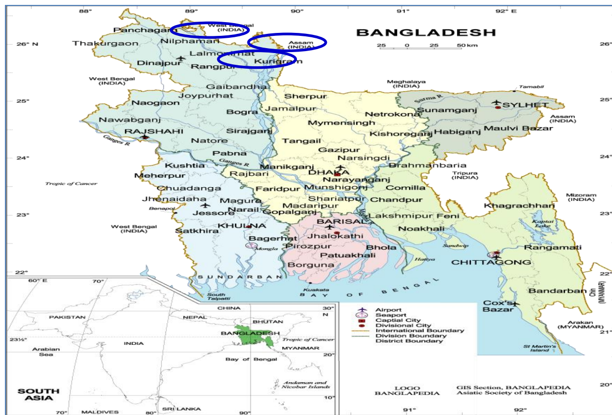
Figure -1. The Map of Bangladesh showing the study area.

A draft interview schedule was prepared in such a way that fulfill the objectives of the study. The draft schedule was pre-tested with 10 households in the selected unions. The schedule was then finalized after necessary correction, modification and adjustments. In this study, mainly economic and social empowerment of women were considered. Both empowerment were measured by structured questions i.e. respondents answered the questions within a given options related to empowerment.