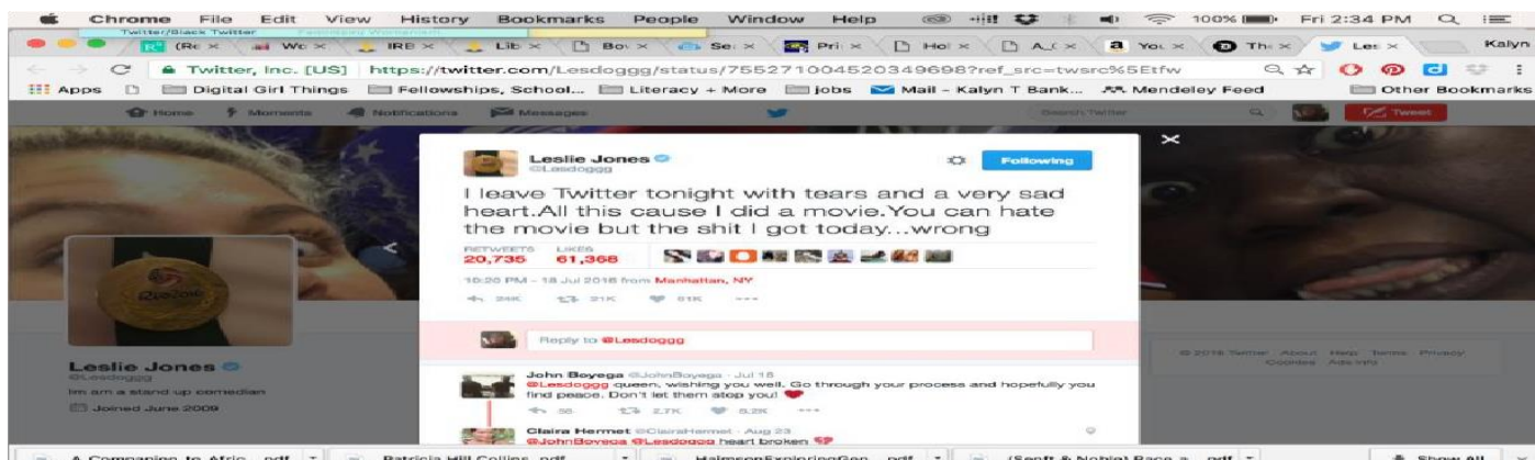
Figure 3 Archived Tweet of Leslie Jones, 2016

The hashtag #LoveForLeslieJ was created on Twitter where people posted positive remarks using the hashtag in order to pad Jones' mentions with positive words in order to help redirect the hateful comments she was receiving. Paul Feig, director of Ghostbusters , was the first to start the trending hashtag in support of protecting Leslie Jones as seen below in Figure 4 (Archived Tweet of Paul Feig, 2016).