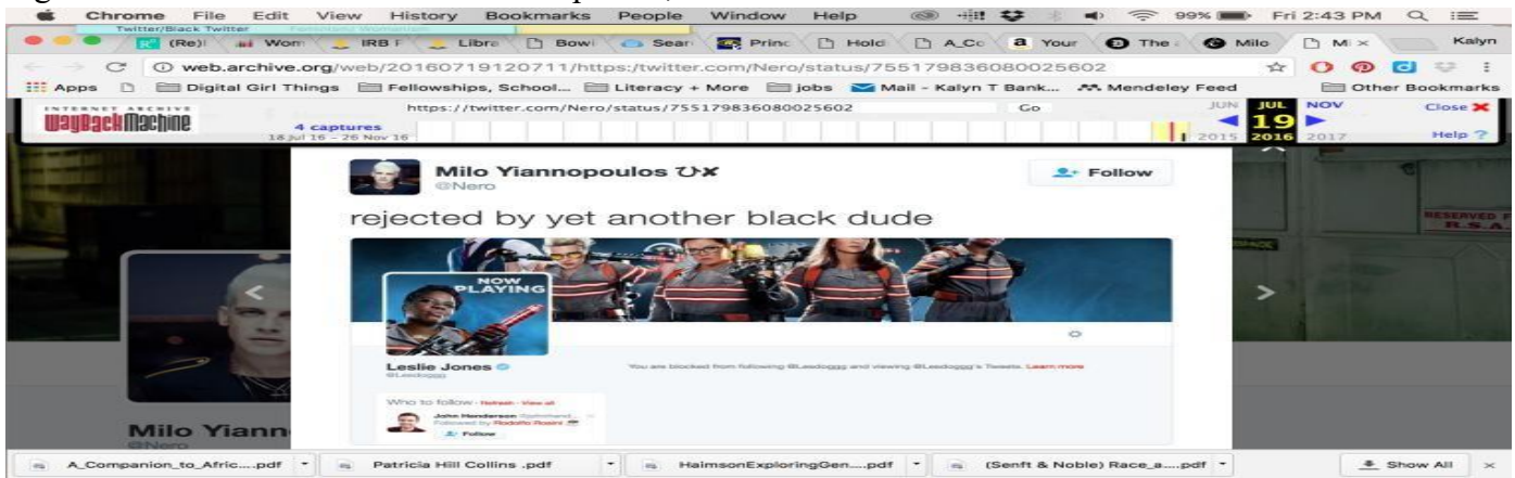
Figure 2 Archived Tweet of Milo Yiannopoulos, 2016

Initially, Jones felt confident confronting her attackers but once the harassment became overwhelming she deleted her account as shown in Figure 3 below (Archived Tweet of Leslie Jones, 2016).