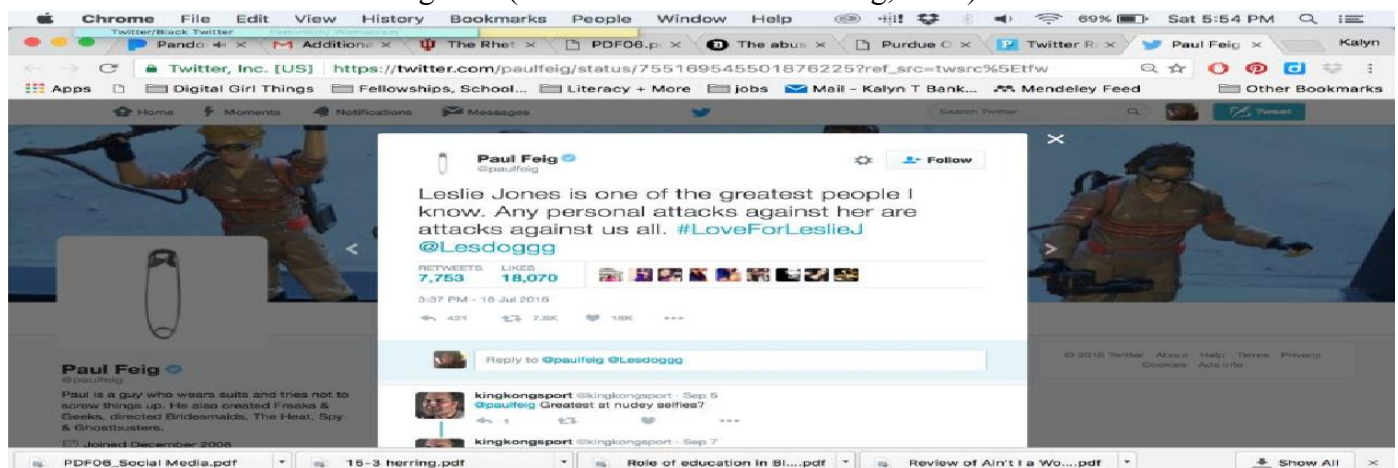
Figure 4 Archived Tweet of Paul Feig, 2016

The hashtag #LoveForLeslieJ was created on Twitter where people posted positive remarks using the hashtag in order to pad Jones' mentions with positive words in order to help redirect the hateful comments she was receiving. Paul Feig, director of Ghostbusters , was the first to start the trending hashtag in support of protecting Leslie Jones as seen below in Figure 4 (Archived Tweet of Paul Feig, 2016).