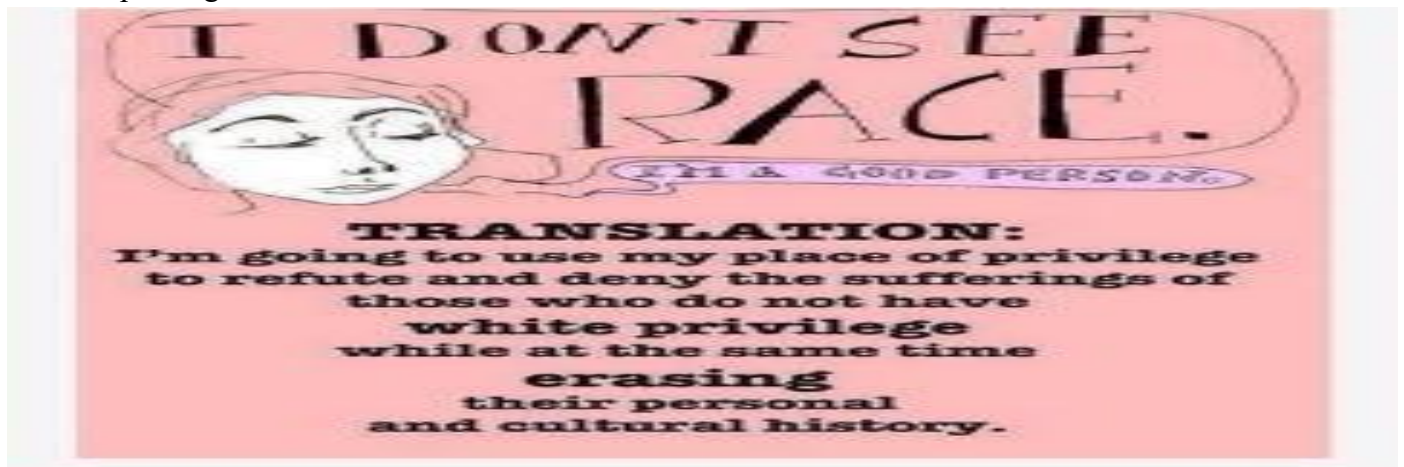
Figure 3: Illustration of #WhiteProverbs Twitter meme (Petray& Collin, 2017)

There is belief that our society tries to deny that there is a distinct divide in class, however it does exist and many “are often reminded that their communications styles and lifestyle choices are not the norm” (Martin, et al, 2013, p.200). Currently the debate of white privilege is the most relevant example of classism in America. White privilege is defined as “the level of societal advantage that comes with being seen as the norm in America, automatically conferred irrespective of wealth, gender or other factors” (Emba, 2016).The ideology of white privilege is a currently a very raw and sensitive topic in our society. Many believe that white privilege is real and is a harsh reality within our society. Furthermore, those that share this belief understand that much work needs to be done to break through this stigma and create an equal playing field for all, no matter their race, ethnicity, or creed. On the other side of this debate is also a group that grossly opposes the idea of white privilege and believe that this is simply a term that was created to further the gap between whites and other races. The conversation of white privilege has been addressed on social media several times over the last few years and there have been many insightful op-eds and journalistic contributions made to the idea of white privilege.