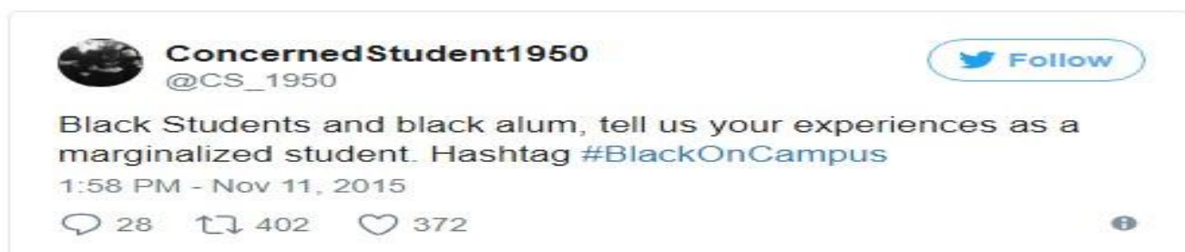
Figure 4: First call to action from students of Mizzou (Twitter, 2015)

For the study of #BlackOnCampus, Twitter was used to conduct an extensive search for tweets that specifically spoke to the movement. Twitter has a search feature that allows users to search for specific users and hashtags. Two searches were conducted, the first using #BlackOnCampus and another using #Mizzou. The #BlackOnCampus search generated thousands of tweets that dated back to November 11, 2015, the first day the movement was established. The search of #Mizzou generated just as many tweets, however many of them were irrelevant to the study causing the researcher to reject this group of tweets. To preserve the transparency of the study, the first 30 tweets were used and grouped together according to themes. The tweets that did not fit into any of the groups were categorized as miscellaneous.